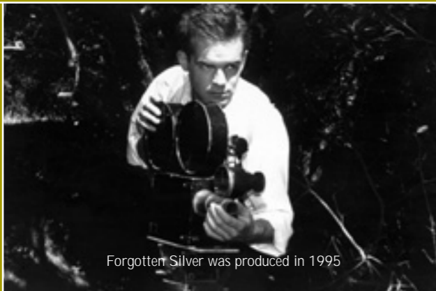
Forgotten Silver was produced in 1995