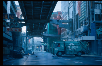
Wellington, Ghost in the Shell , Paramount Pictures and DreamWorks Pictures

An easy 12 hour, non-stop, overnight flight from Los Angeles