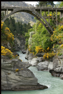
Shotover River, Queenstown