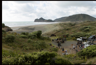
Auckland, Shannara Chronicles , MTV