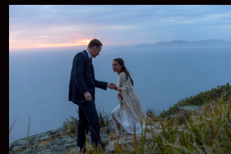
Marlborough, Light Between Oceans , DreamWorks Pictures