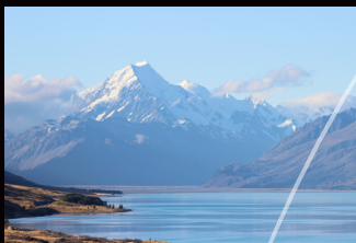
Aoraki Mount Cook, Canterbury