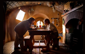
Wellington, The Hobbit: An Unexpected Journey , New Line Productions