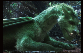
Tokoroa, Disney's Pete's Dragon , Walt Disney Studios