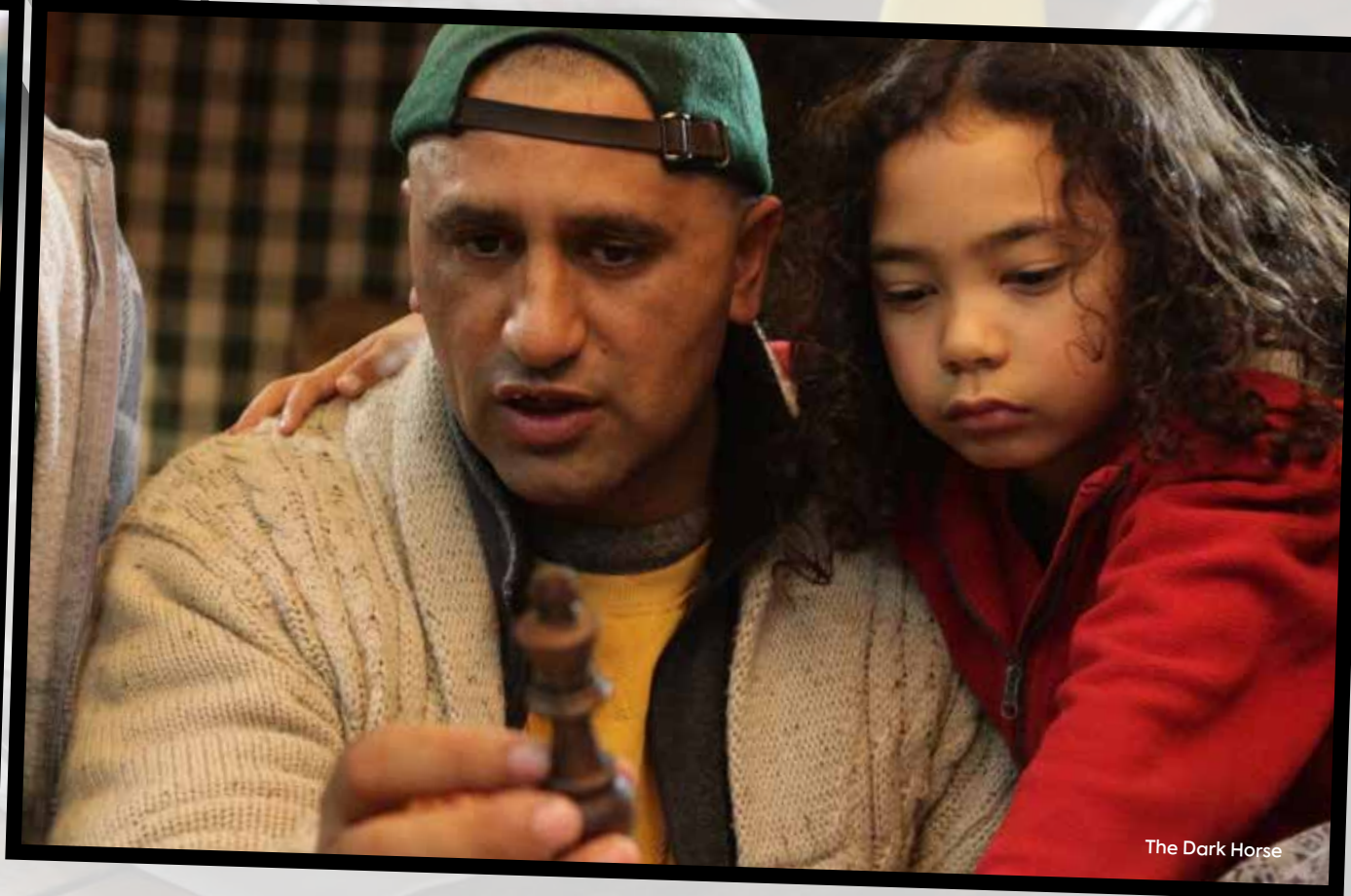
The Dark Horse