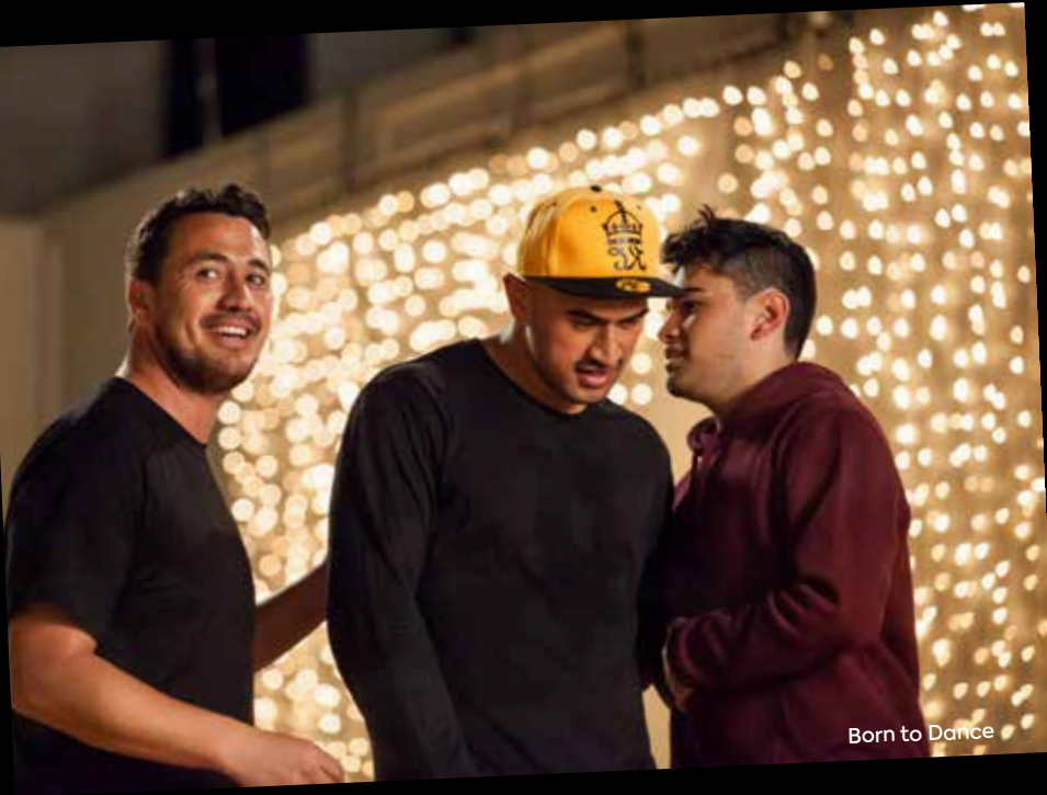
Born to Dance