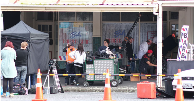
WHISKER On Location: Street scene