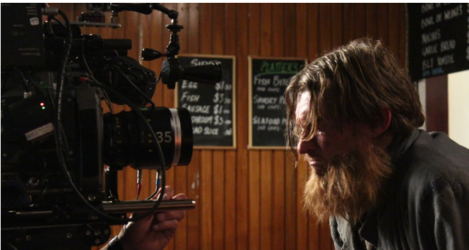
WHISKER On Location: Pub closeup