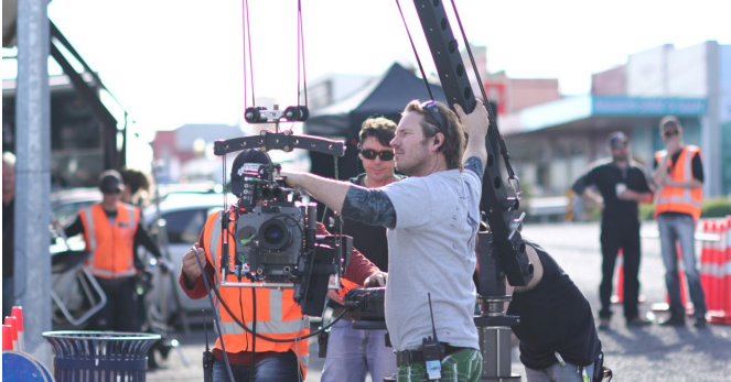
WHISKER On Location: Bungy rig