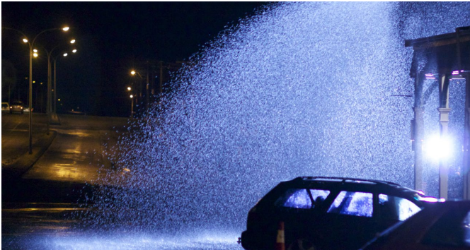
WHISKER On Location: Rain machine