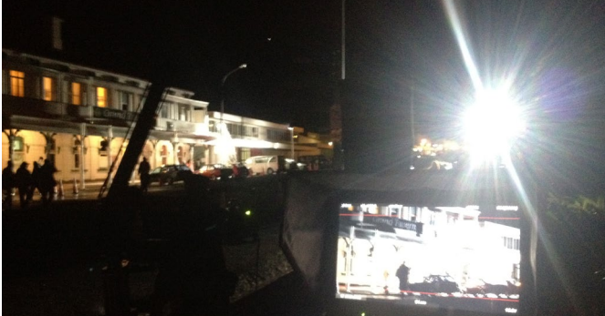
WHISKER On Location: Pub at night