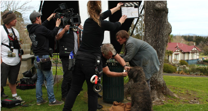
WHISKER On Location: Rubbish bin