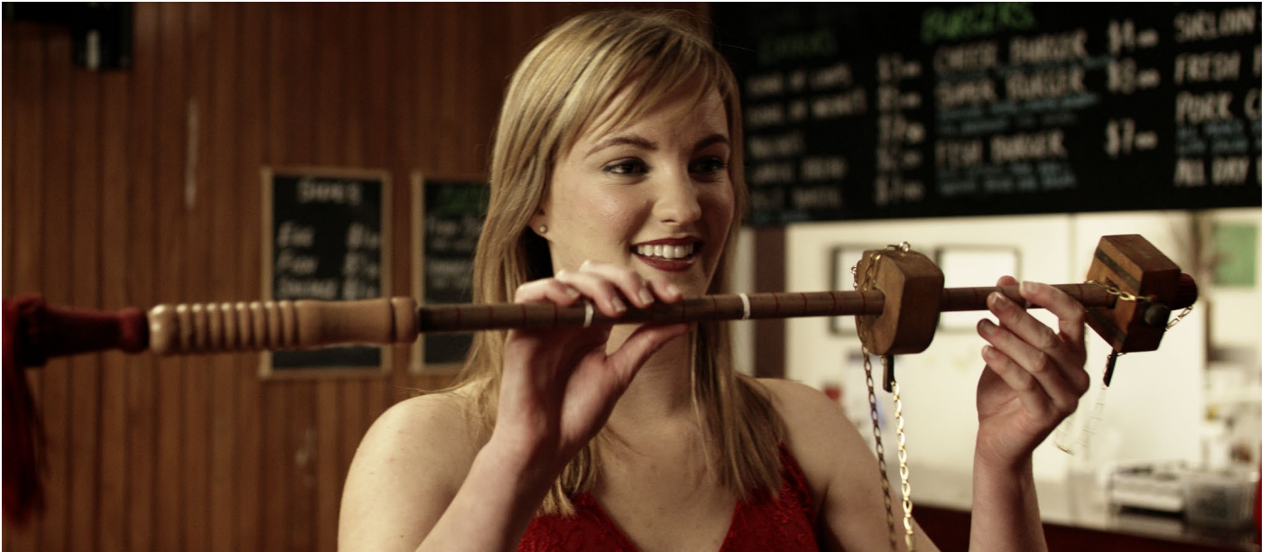
WHISKER Film Frame: 'Shirl Wields the Beardometer'