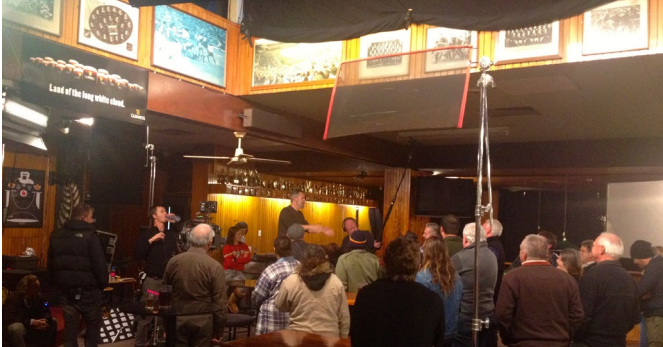
WHISKER On Location: Conducting extras