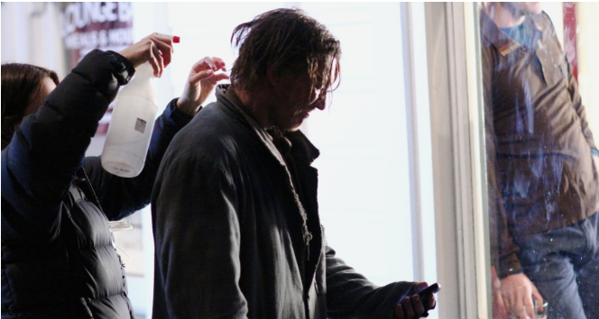
WHISKER On Location: Hairdo