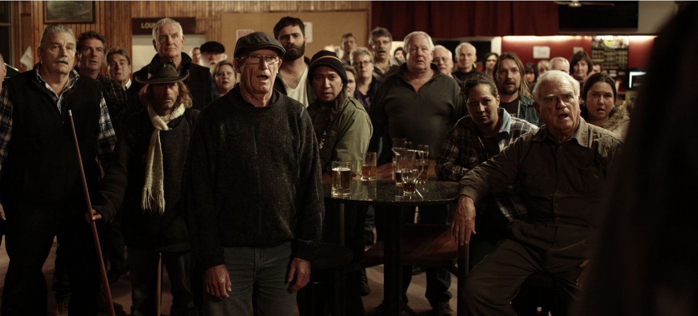
WHISKER Film Frame: 'Pub Crowd Aghast'