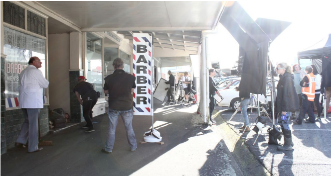
WHISKER On Location: Barber shop