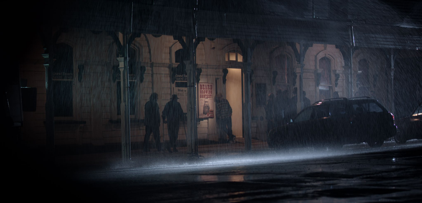
WHISKER Film Frame: 'Locals Arrive'