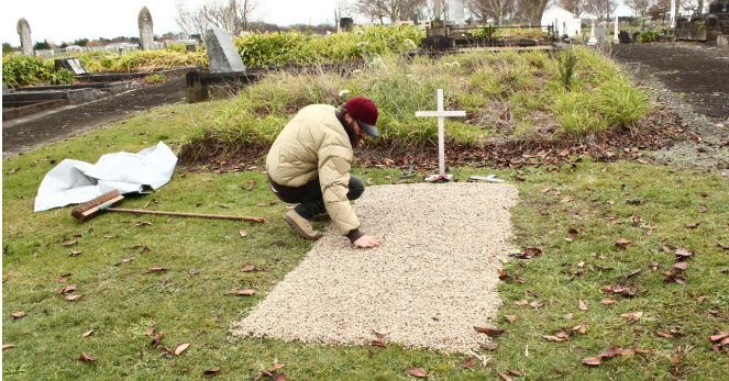
WHISKER On Location: Excavation