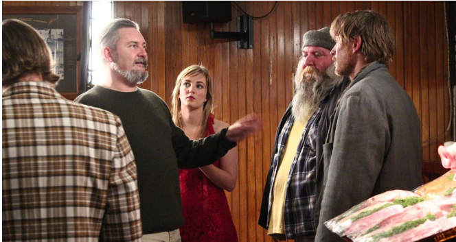
WHISKER On Location: Director directing.