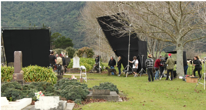
WHISKER On Location: Farewell