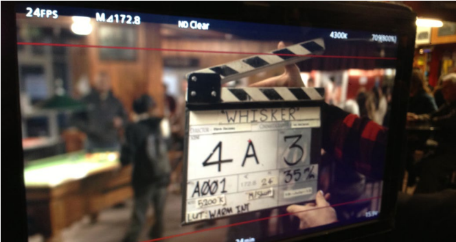
WHISKER On Location: Clapper board