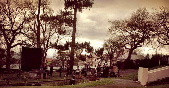
WHISKER On Location: In the park