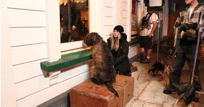
WHISKER On Location: Dog at window