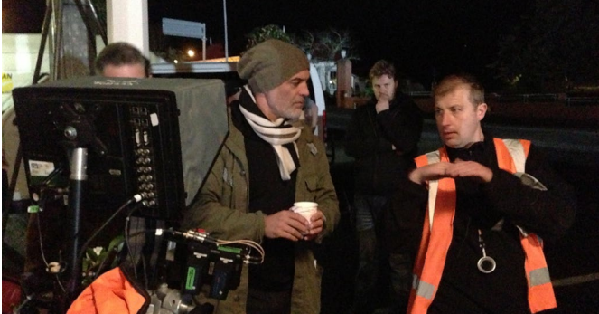
WHISKER On Location: DOP at work