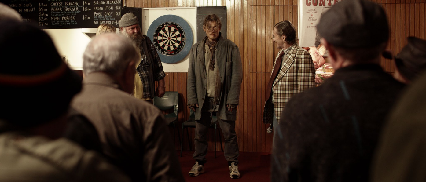
WHISKER Film Frame: "You are aware this is a beard growing competition?"