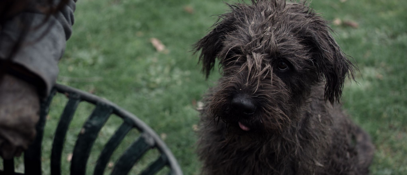
WHISKER Film Frame: 'Hungry Dog'