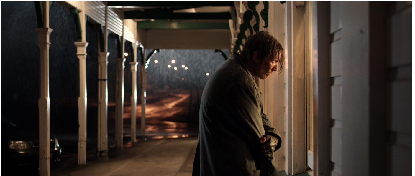
WHISKER Film Frame: 'The Man looks in the window'