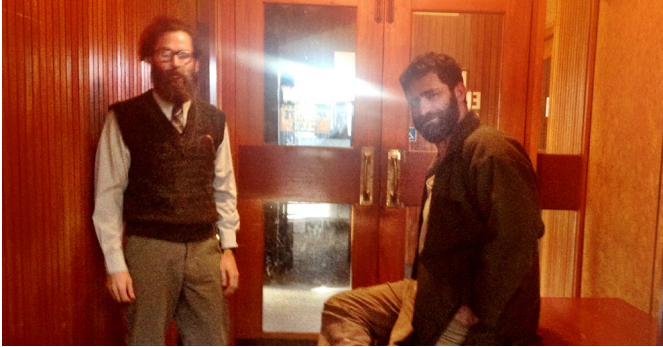
WHISKER On Location: Beardos