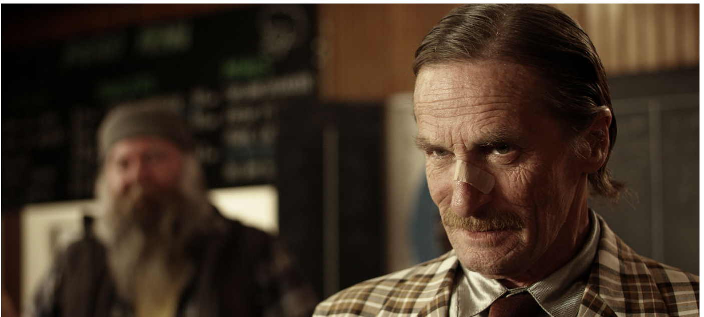
WHISKER Film Frame: "C'mon up, Champ"