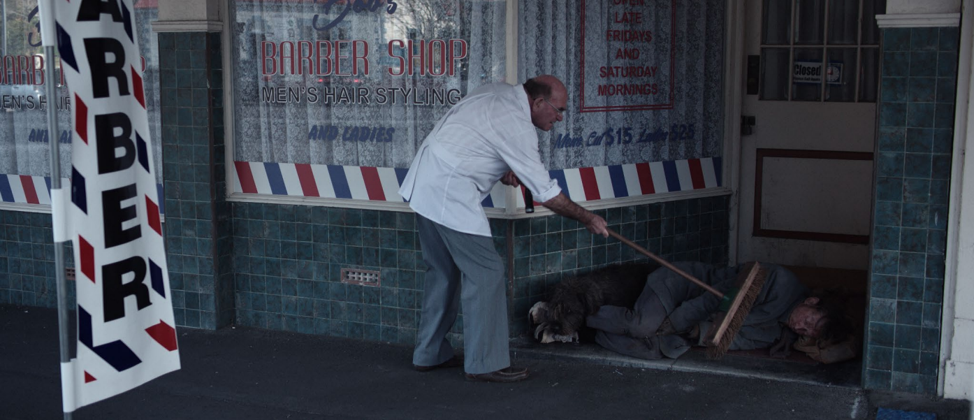
WHISKER Film Frame: 'Get outta here'