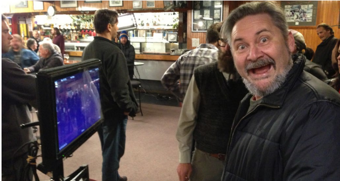
WHISKER On Location: Director at video split