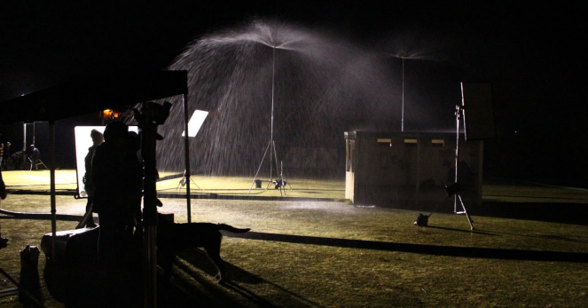
WHISKER On Location: Bus stop rain